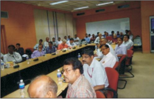
Audience during the talk

low frequencies are key for imaging deeper structures, improving the accuracy of the seismic inversion. High frequencies are beneficial for enhancing spatial and temporal